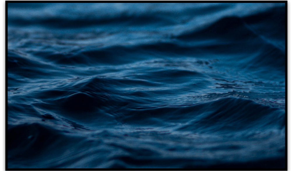
our sea of emotions

Sea water is powerful and there are also persistent sexual thoughts with a fear of penetration.